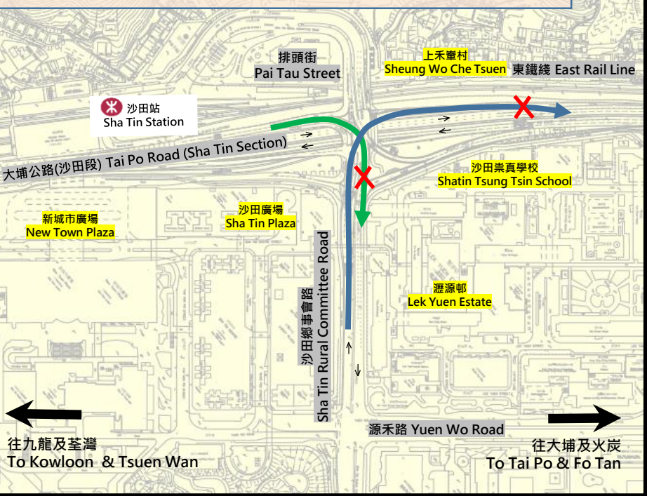
禁止轉向路線 Ban Turning Routes