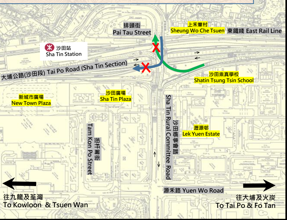
禁止轉向路線 Ban Turning Routes