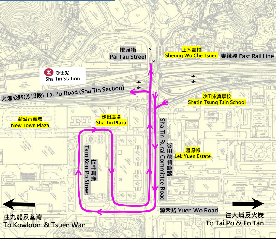
替代路線 Alternative Route

沙田鄉事會路及大埔公路 – 沙田段(南行)支路行車線臨時交通安排及替代路線 實施日期：2024年11月5日及13日，凌晨1時至早上5時30分