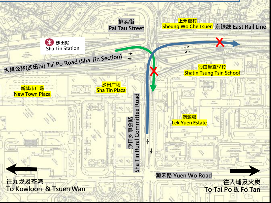
禁止转向路线 Ban Turning Routes