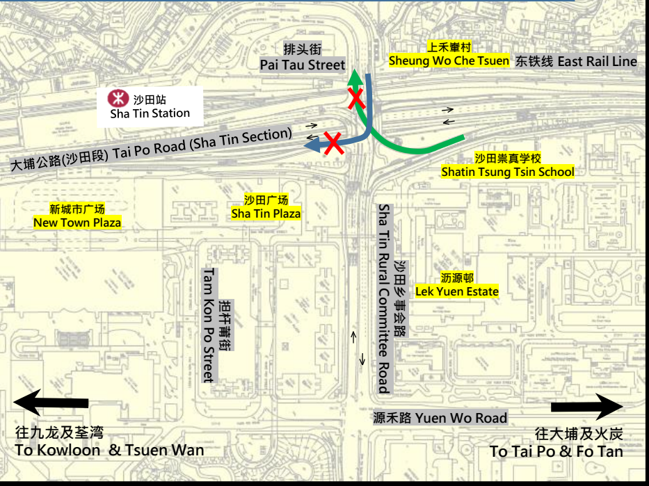
禁止转向路线 Ban Turning Routes