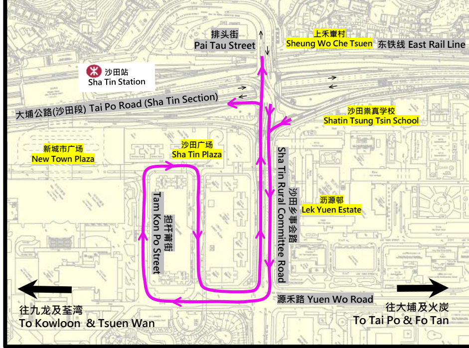
替代路线 Alternative Route

沙田乡事会路及大埔公路 – 沙田段(南行)支路行车线临时交通安排及替代路线 实施日期：2024年10月4日及10日·凌晨1时至早上5时30分