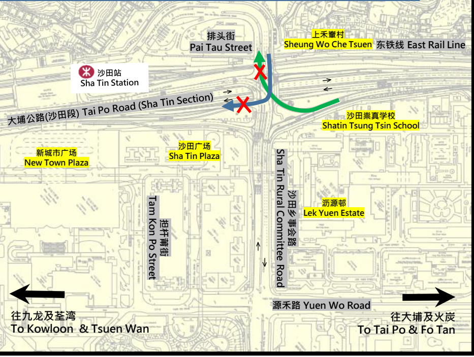
禁止转向路线 Ban Turning Routes