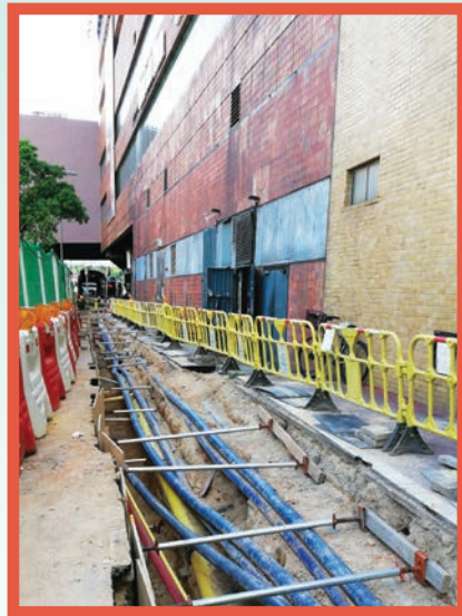
遷移介乎蔚景園至沙田街市單車徑的地下設施 Utility diversion on cycle track between Scenery Court and Sha Tin Market