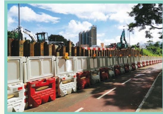
大埔公路近禾輦邨進行隔音屏障地基工程 Construction of noise barrier foundation along Tai Po Road southbound near Wo Che Estate