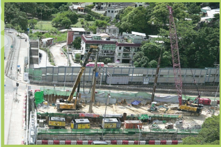
沙田鄉事會路支路旁興建企樁 Construction of soldier pile alongside slip road of Sha Tin Rural Committee Road