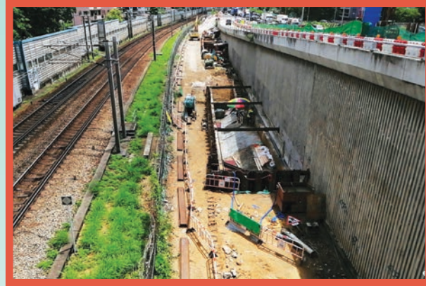
沙田鄉事會路支路興建護土牆 Construction of retaining wall alongside slip road of Sha Tin Rural Committee Road