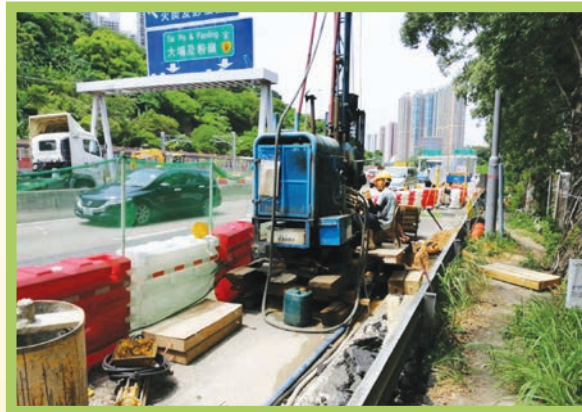
進行隔音屏障地基探鑽工程 Pre-drilling for noise barrier foundation works