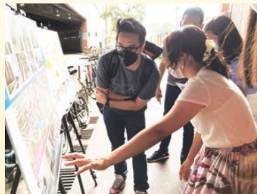
與單車組織代表(左)會面 Meeting with cyclist associations

To maintain the effectiveness of communication, we closely liaised with our stakeholders from time to time to report the progress of works and seek for advices.