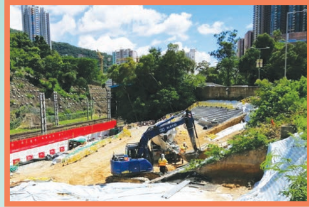
鄰近火炭路斜坡加固工程 Slope modification works near Fo Tan Road