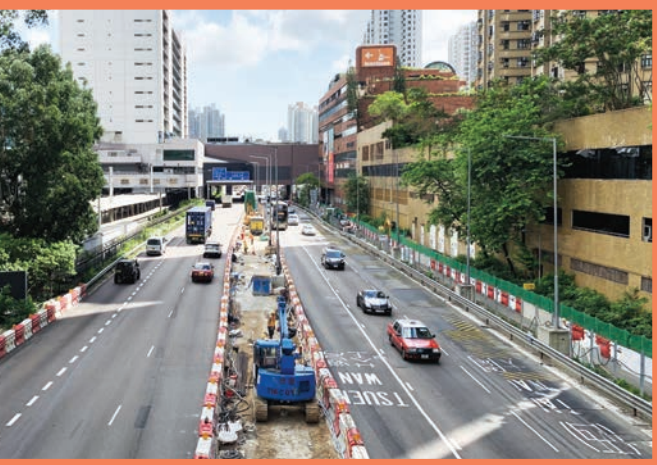
偉華中心對出中央分隔帶位置興建迷你樁 Mini-pile construction in front of Wai Wah Centre at central median of Tai Po Road