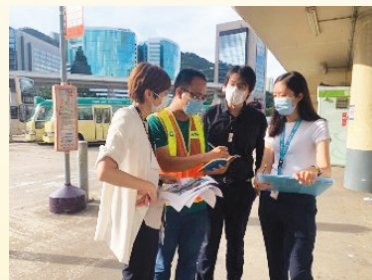
與鄰近學校、住宅及商場的管理代表會面 Meeting with managing representatives of nearby schools, residential and commercial buildings