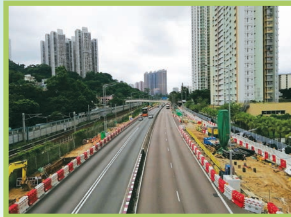
豐禾邨對出路肩位置興建迷你樁 Mini-pile construction in front of Fung Wo Estate alongside Tai Po Road southbound