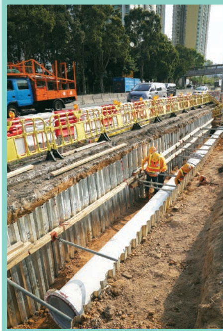
沿大埔公路進行水管改道工程已於9月中旬完成 Watermain diversion works along Tai Po Road was completed in mid-September 2020