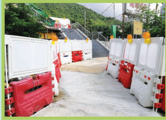
改建後的禾輦街行人天橋樓梯已於9月初開放予公眾使用 Modification of footbridge staircase at Wo Che Street was completed and opened for public use in early September 2020.